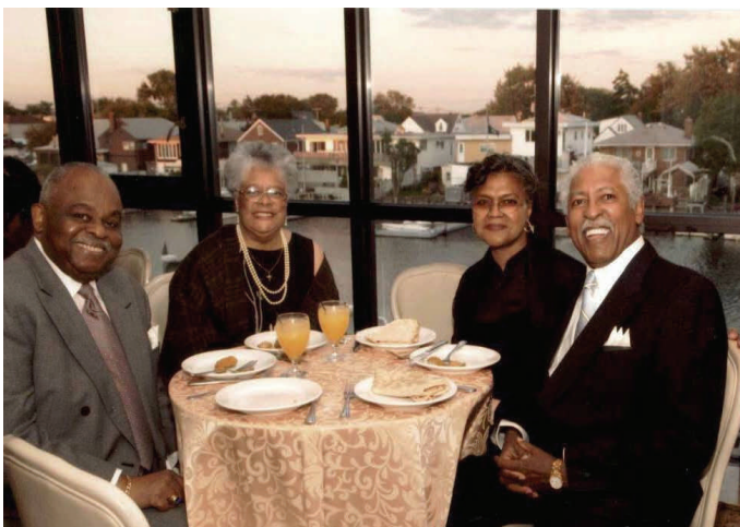
Guests enjoying cocktail hour overlooking the water at Russo's On The Bay.

Funds raised from the Gala are used to enhance senior services and programs at JSPOA. ■