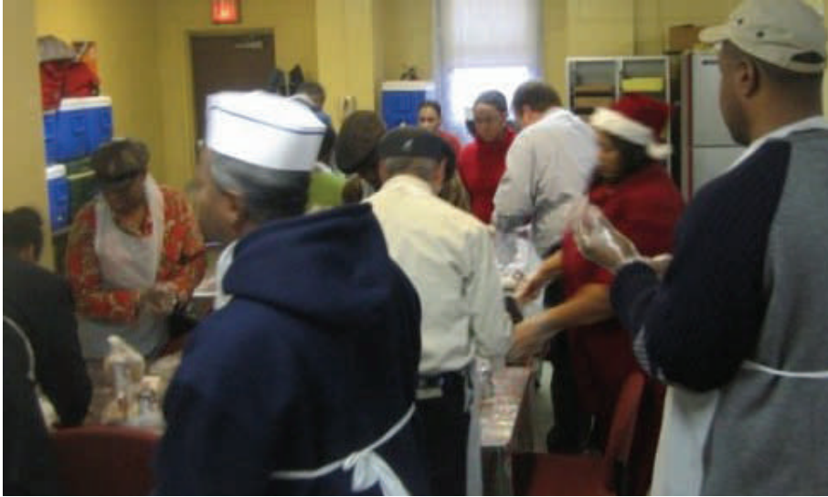
Volunteers package Christmas dinner to bring to homebound seniors in Southeast Queens.